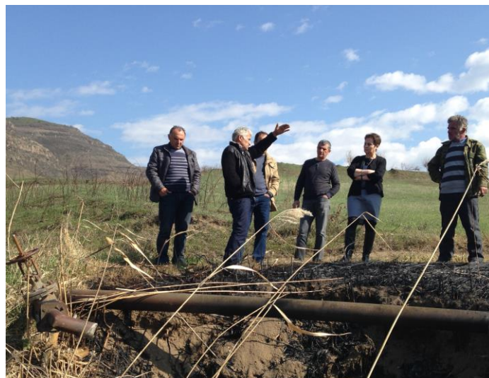
Initial assessment of current irrigation pipes in Chinari village, Tavush region