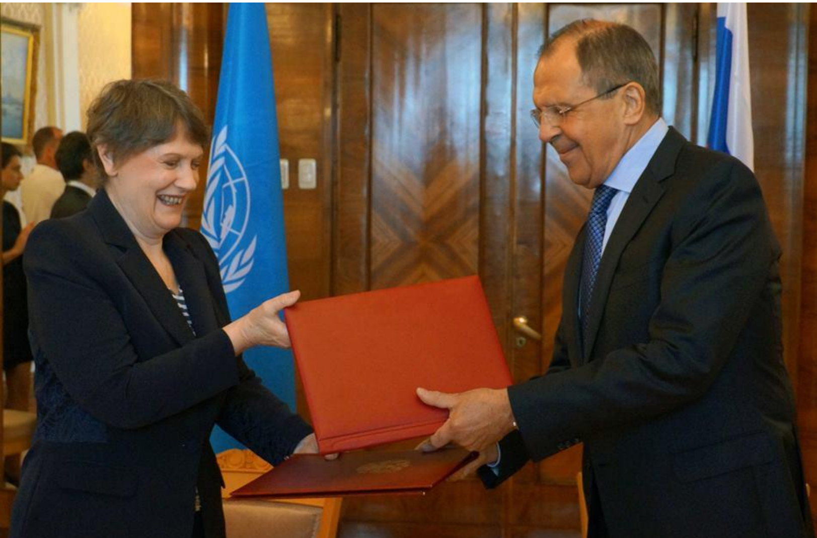
Trust Fund Agreement signing ceremony