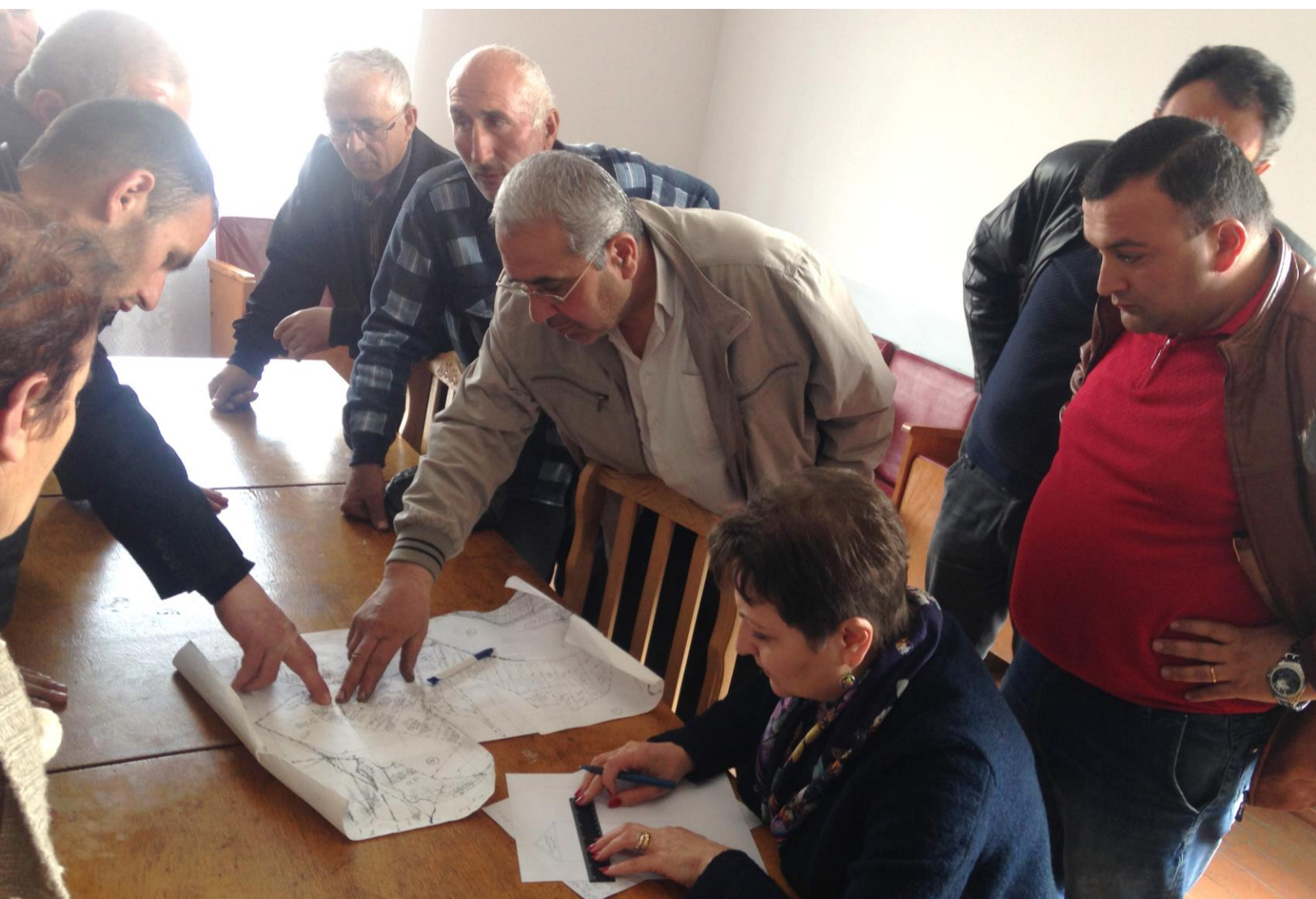
Discussion with community members and village major on planting fruit orchards in Baghanis village