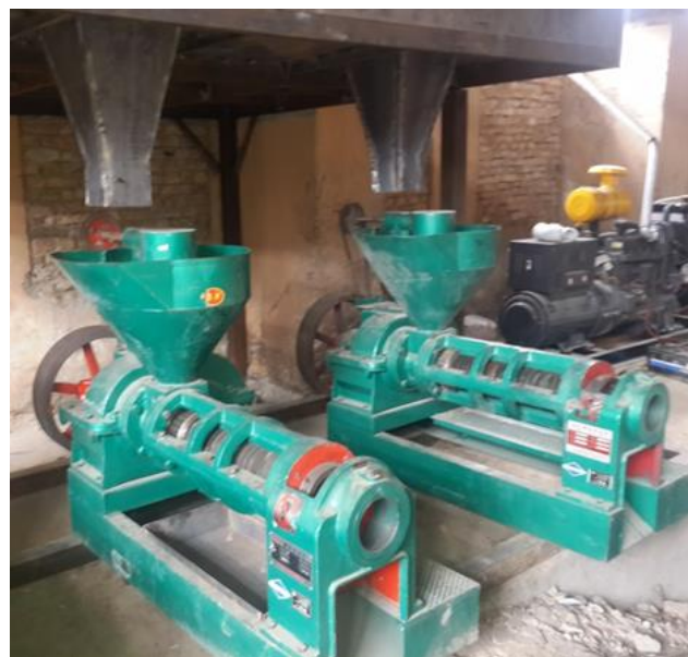
New equipment to produce oil in Gusar village

Representatives of the Ministry of Foreign Affairs of the Russian Federation and the Ministry of Economic Development of the Russian Federation took part in the project Steering Committee and visited project implementation sites in March 2016 to monitor the progress. Participants evaluated the project as being on track and delivering expected results.