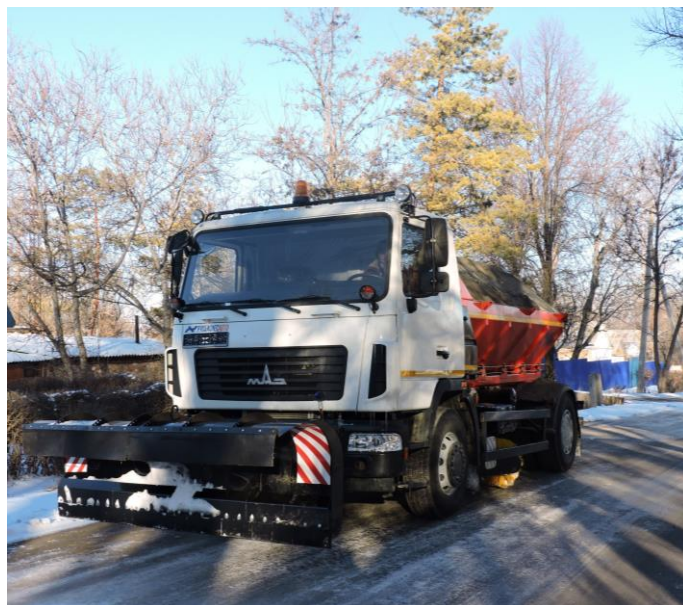
Street maintenance and cleaning vehicle in Orlovka