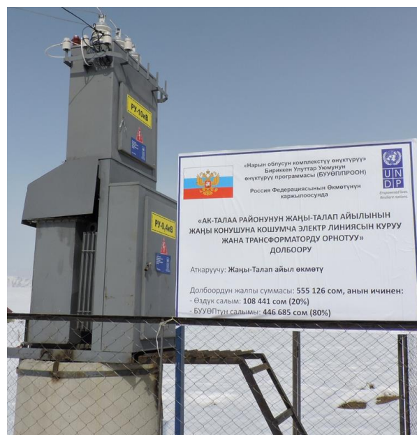
New transformer station