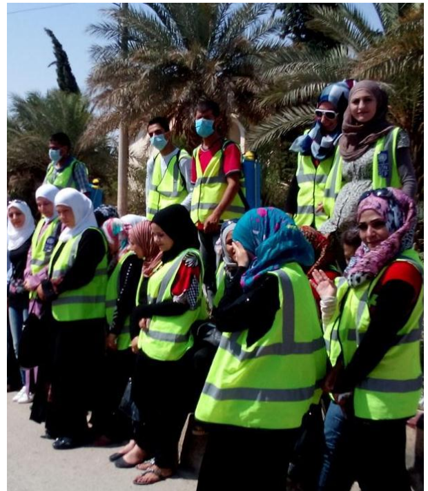
Female team that contributed to solid waste removal in schools and shelters in Deir-Ez-Zor