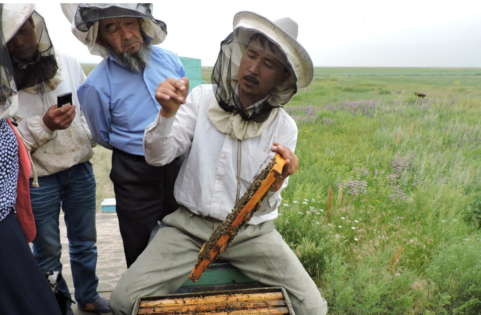
Beekeeping training in Naryn