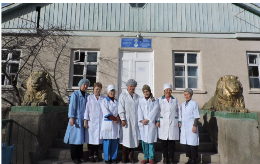
Hospital renovation in Kadji-Sai village