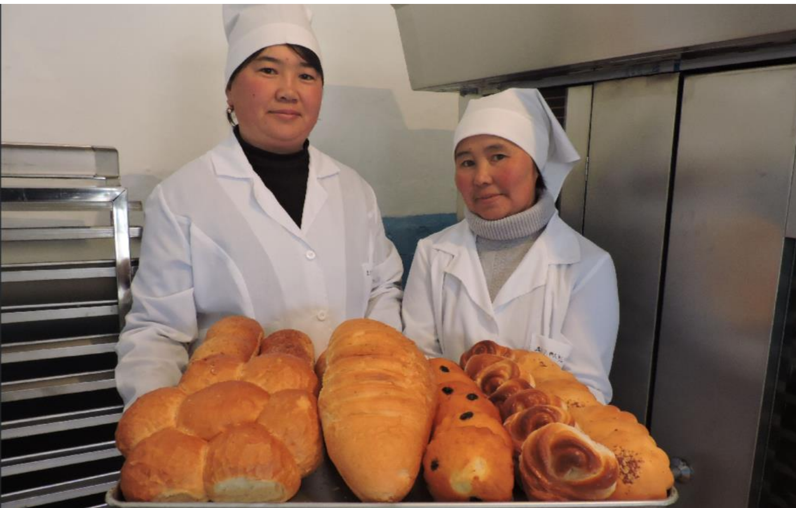
Bakery supported by a grant in Kadji-Sai village of Issyk-Kul region