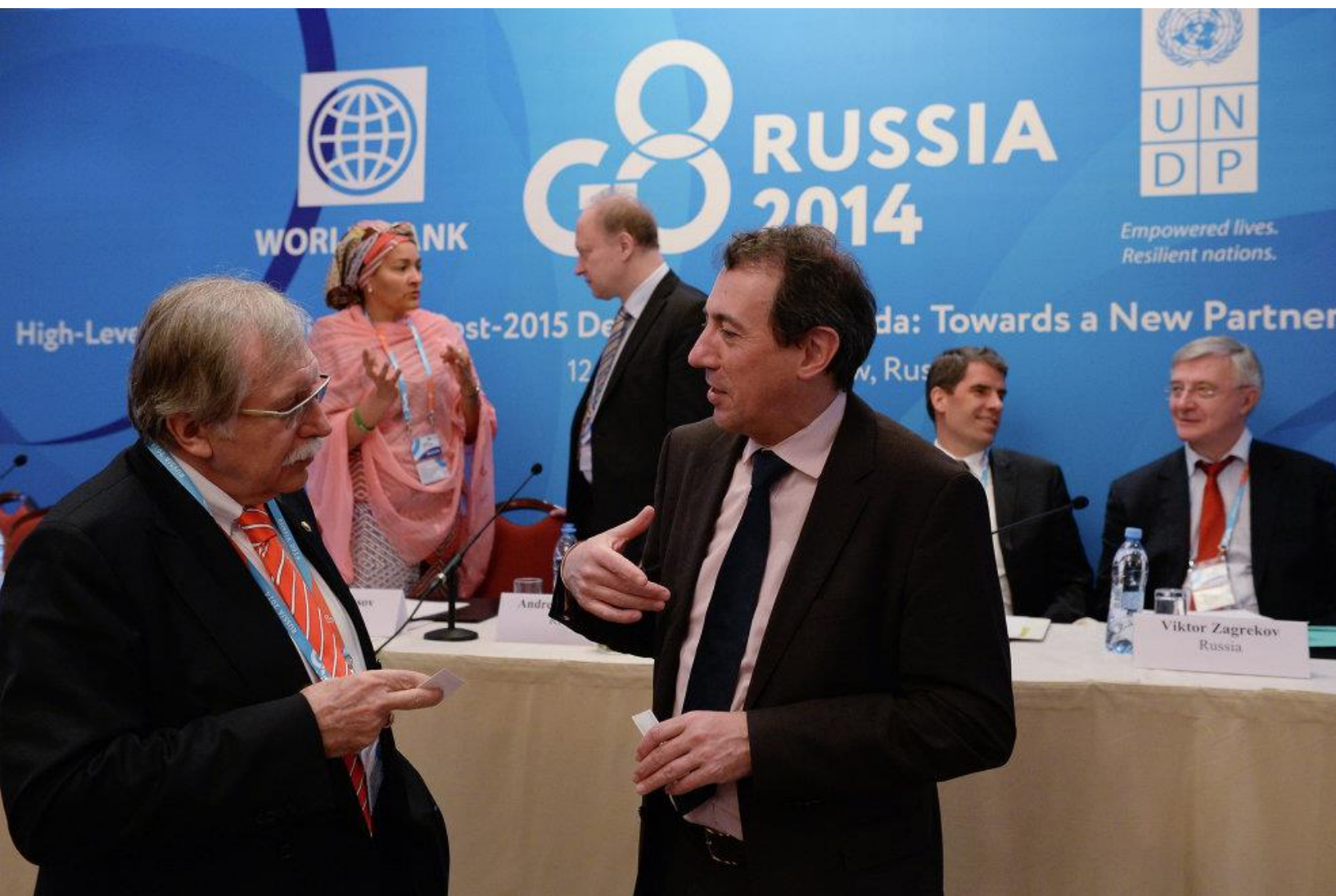
High level meeting on Post-2015 agenda, March 2014