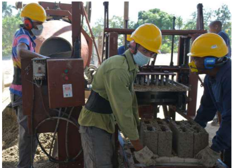
Construction materials production, Santiago de Cuba

Russia has also provided $0,5 mln. assistance to UNDP for the Vanuatu Cash for Work and Debris Clearance Initiative following Tropical Cyclone Pam which struck 22 islands of Vanuatu in March 2015.