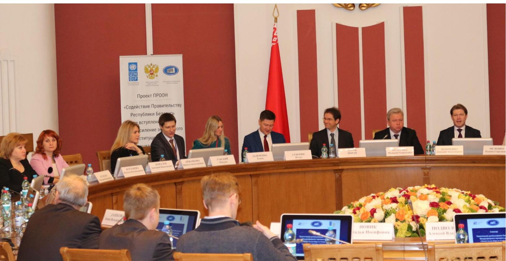
Seminar on practical use of International Trade Centre databases, Minsk, March 2016